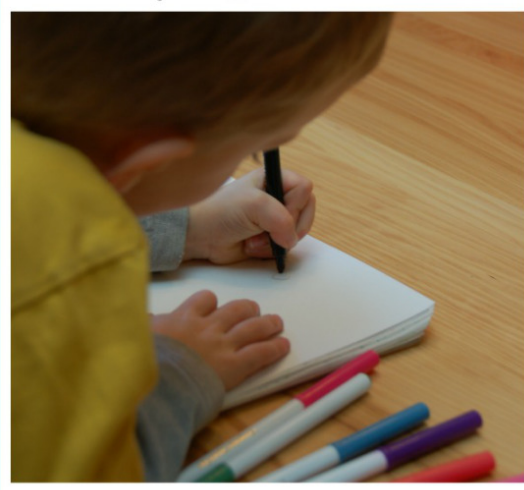
a 10-part series This Reading Mama & The Measured Mom